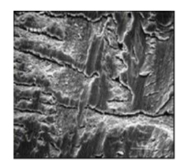
After Leading Synthetic*